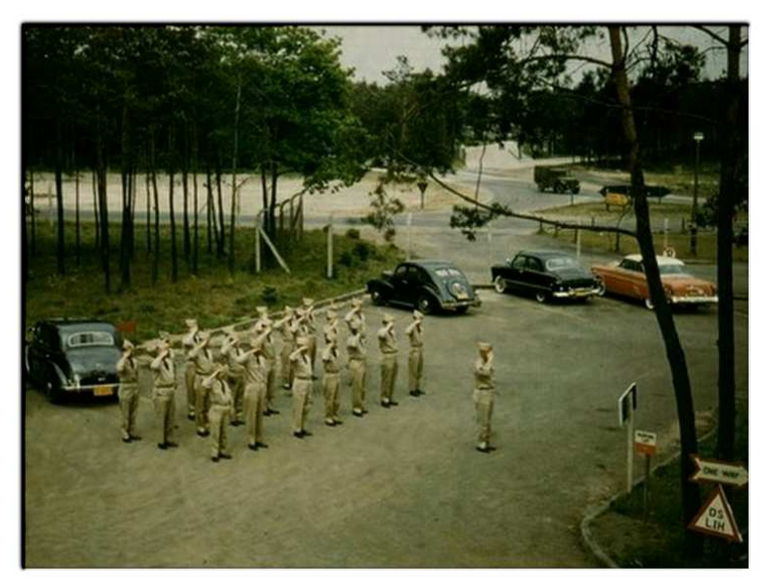
This was a rare "company formation." I think we had one of these for an IG inspection one time. As I recall the motor pool's job for the IG inspection was to dispatch on the road as many vehicle as possible, so they weren't around for inspection. Does this ring a bell, Dom?