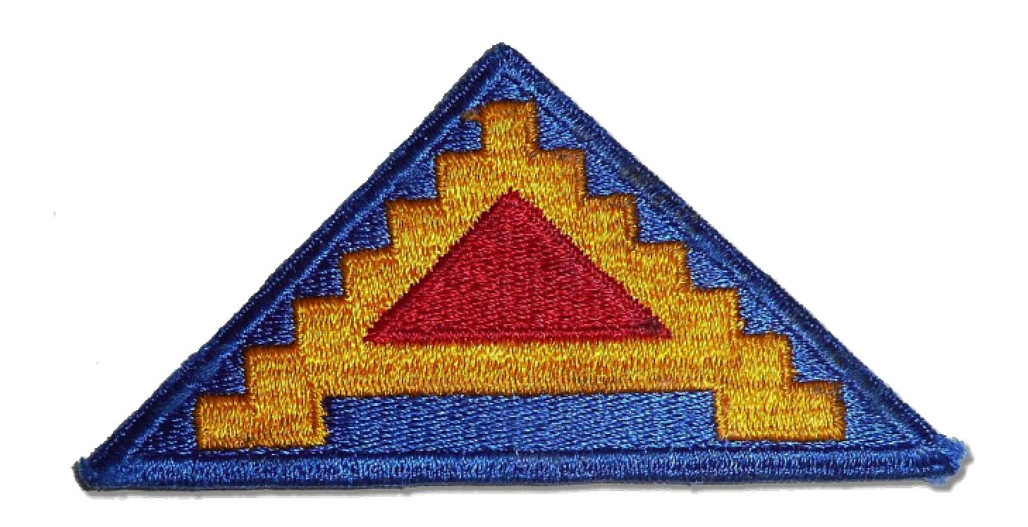
"Seven Steps to Hell"