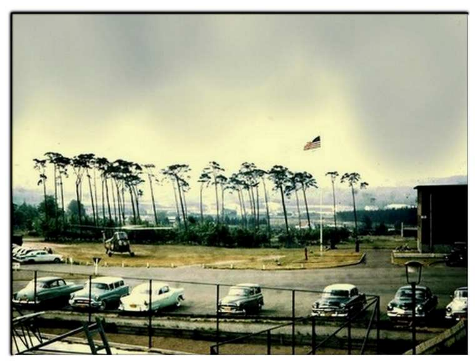
Headquarters building at far right. Nice collection of cars. 'Bet you can name all the years and makes. A collection like this must be worth several hundred thousand dollar now--in this condition. I'd love to have that Buick wagon! Note helicopter in background.