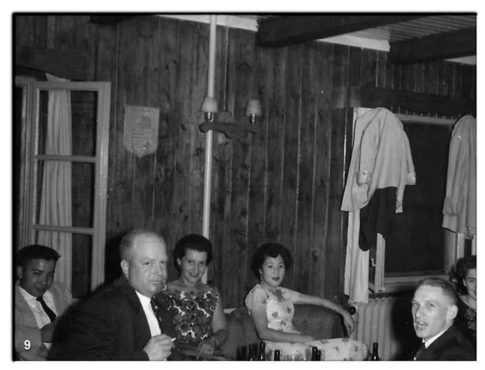
Is that the Chinese doctor at left? Seems at one time we had a company clerk that was Asian and from California.