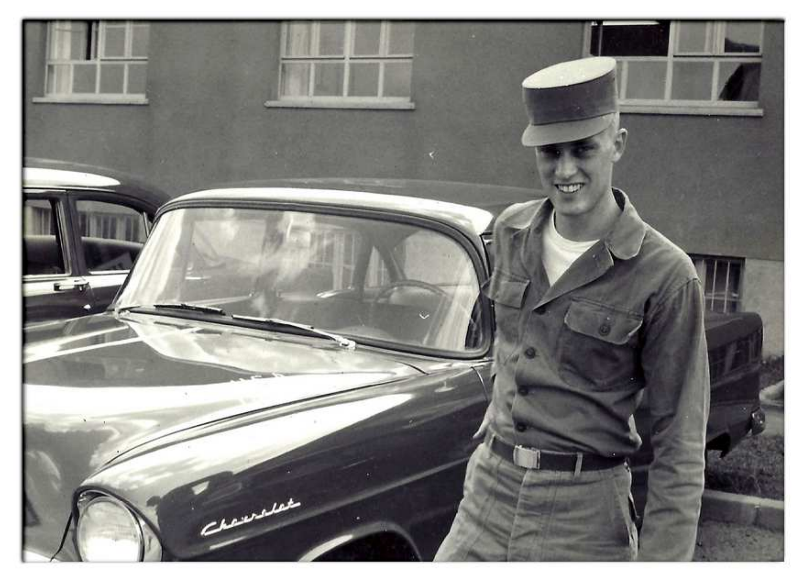
New Chevy and Deeley