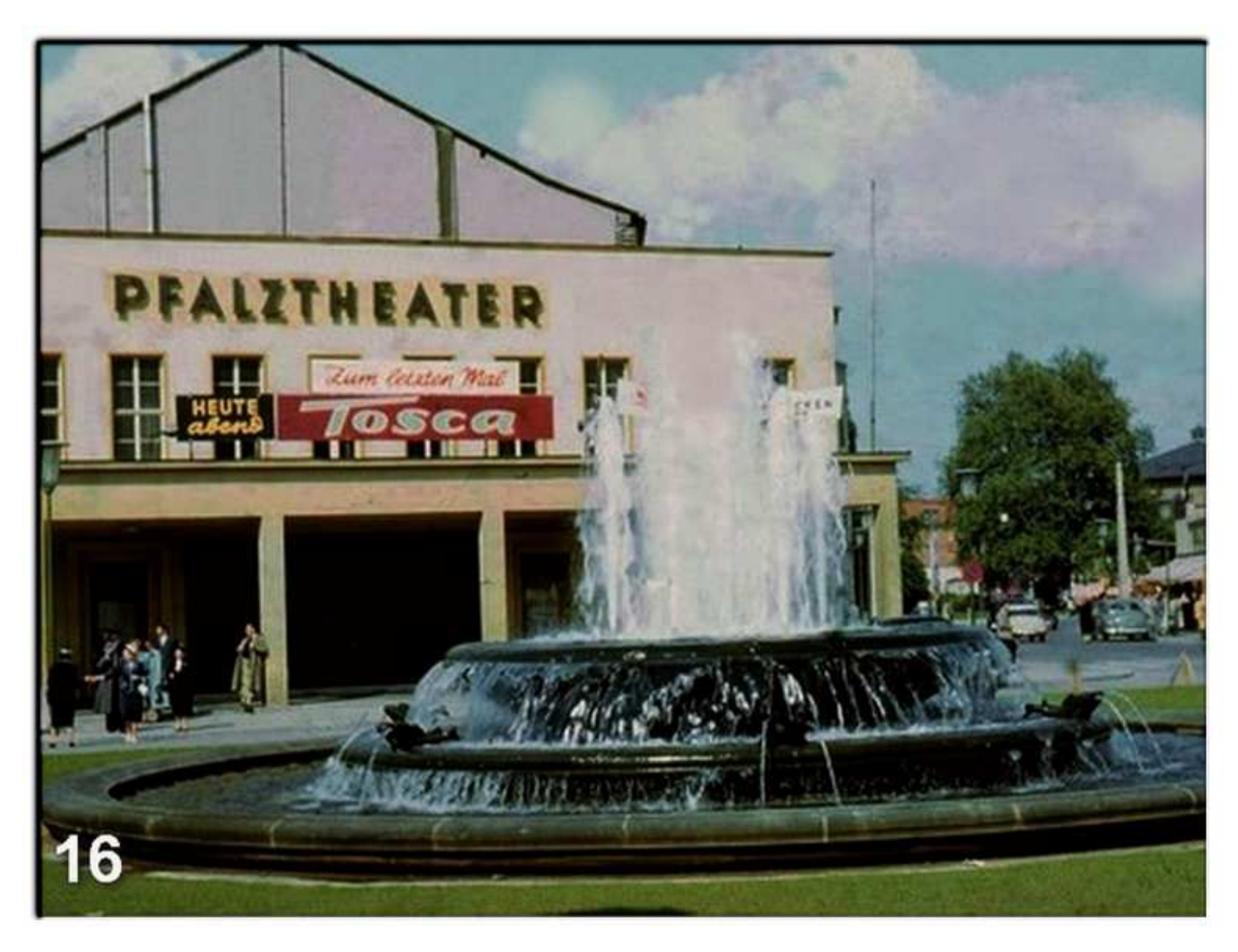
Downtown Kaiserslautern. I read one time that this area was the largest community of Americans outside of the U.S.