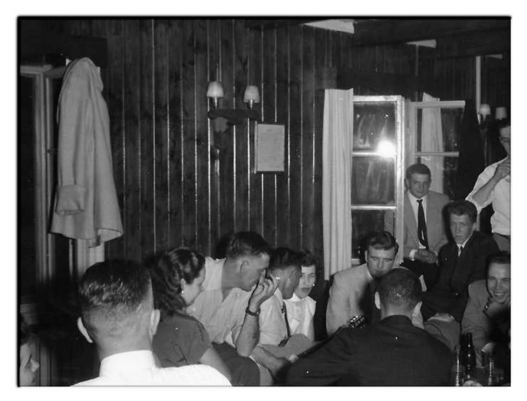
Someone entertaining the troops with the guitar