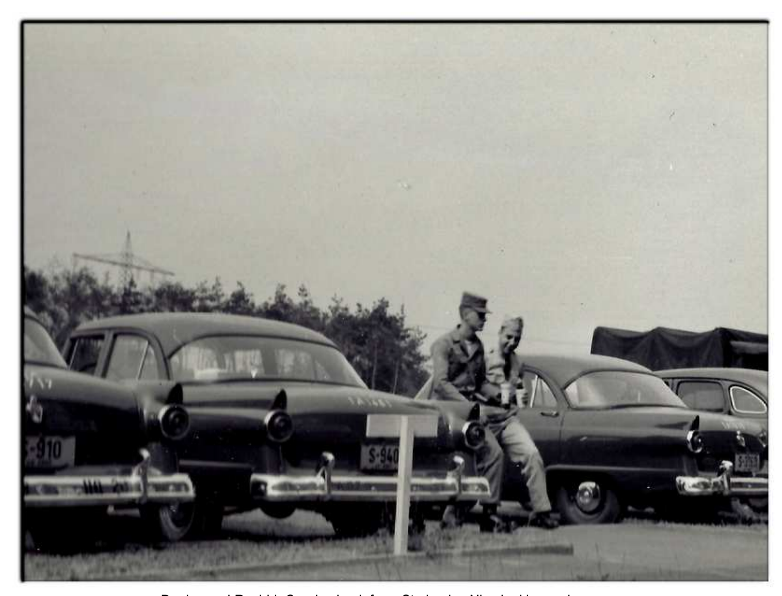
Deeley and Rashid-Coming back from Starbucks. Nice looking sedans.