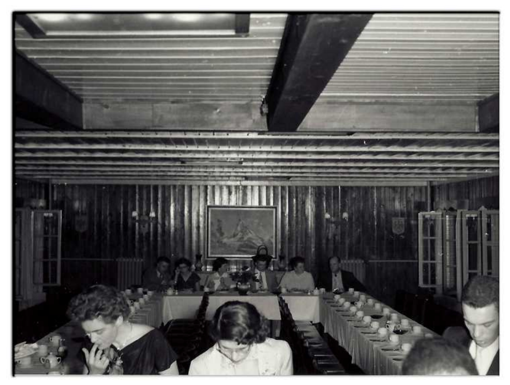
I thought the troops were supposed to be fed first! Look at all that wood! If this caught fire it would probably have gone up in 2 minutes. Thanks for all the windows.