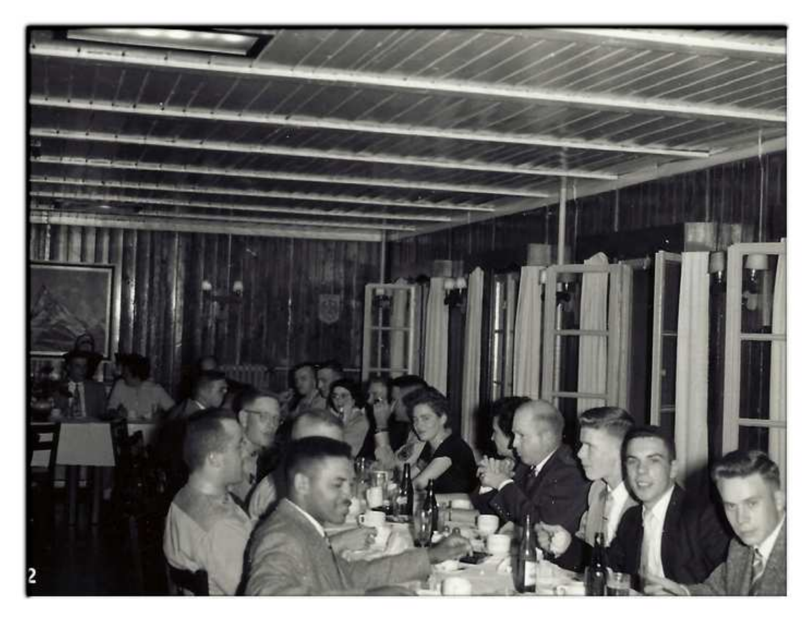
Lot's of familiar faces. Are you anywhere in here?