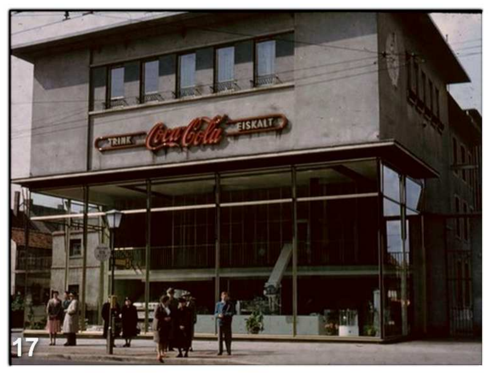
Downtown Kaiserslautern. Coca-Cola bottling plant