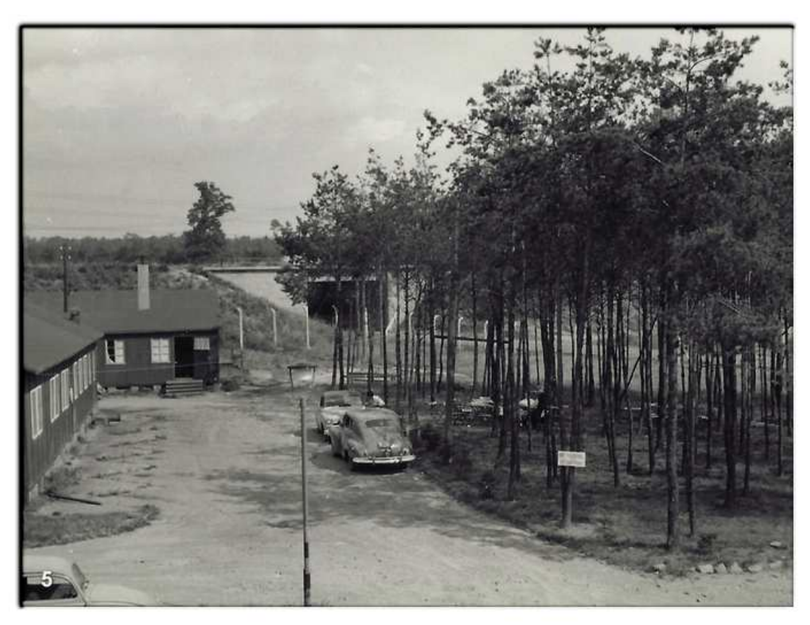
From out the back window of barracks--the EM club. (It really looks like a fire trap!)